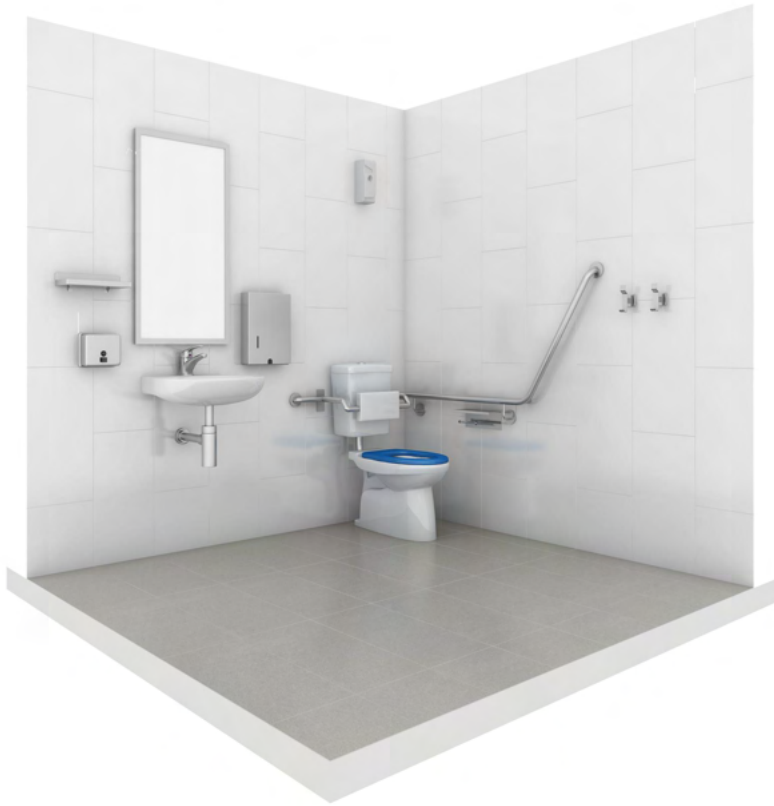
Representational image of an Accessible Toilet including Metlam Australia Commercial Washroom Accessory products. Other bathroom layouts available.

Accessible Toilets are designed to provide adequate space to accommodate wheelchair access and assistance when transferring from a wheelchair to the toilet. Accessible Toilets include features such as lower mirrors and washbasins, contrasting toilet seat colour, grab rails and braille signage.