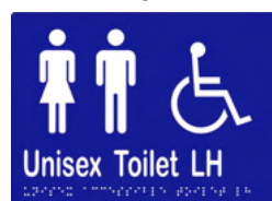
Braille Signage Unisex Accessible Toilet Left Hand Transfer ML16222